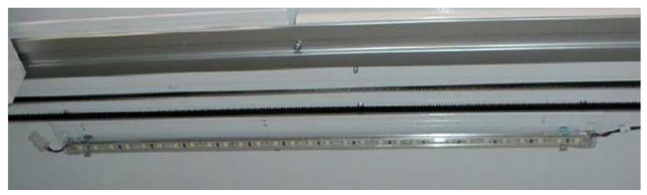
Upper LED Assembly with mounting bracket

Note: Keep sealing material from monetary panel access hole to reinstall if removing entire LED light from machine.